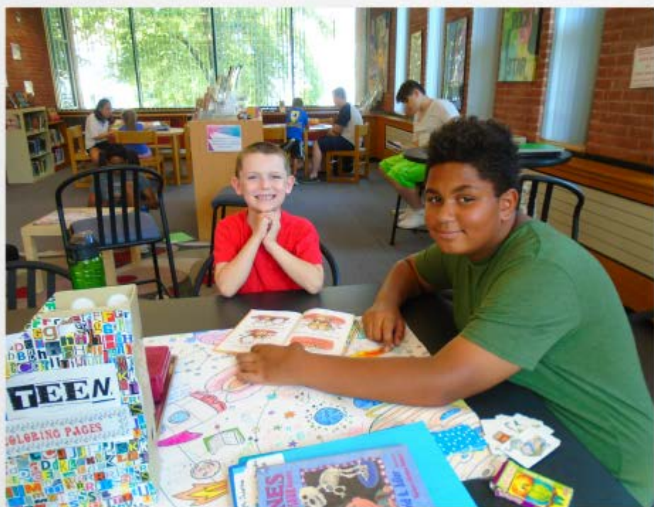
2019 program participants